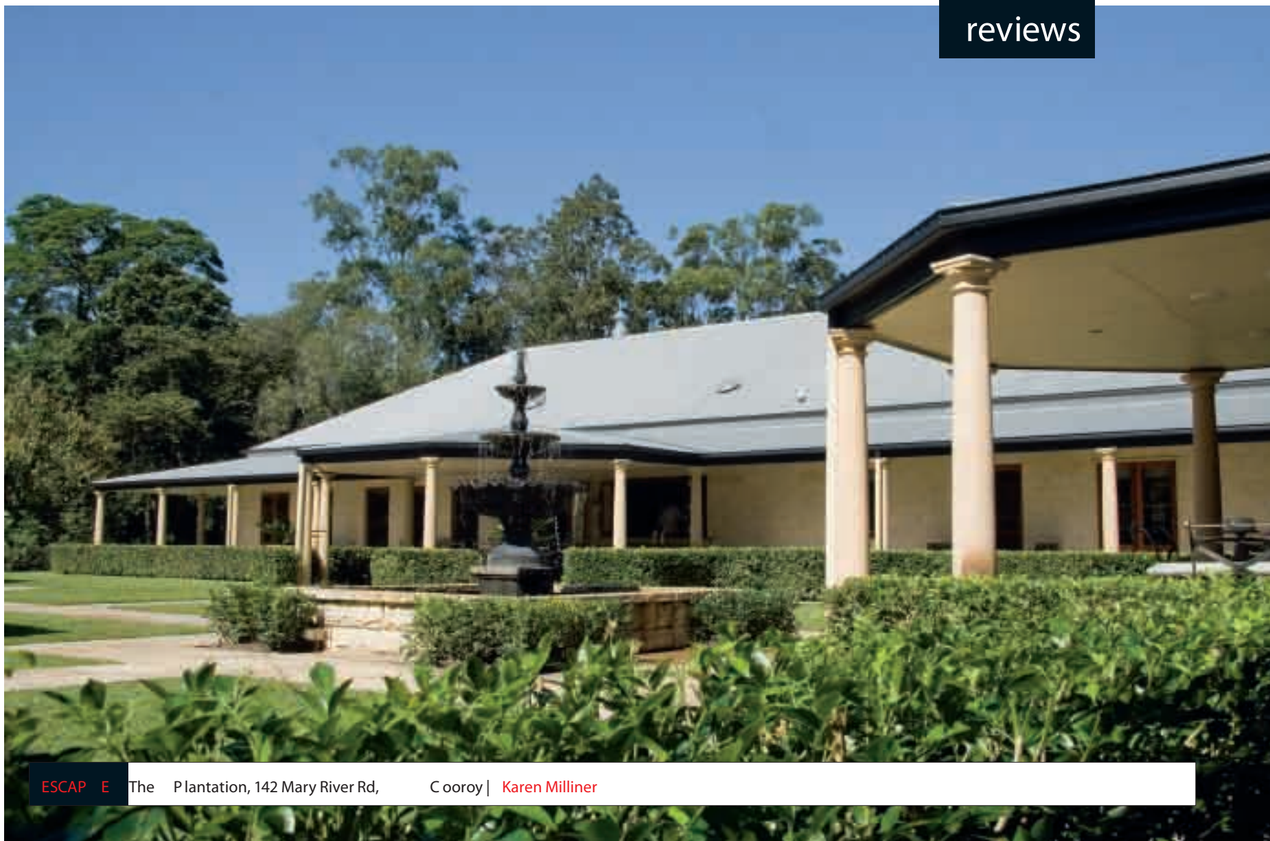
ESCAP E The Plantation, 142 Mary River Rd, Cooroy

Crossing the parquet-floored threshold into the genteel surrounds of The Plantation's main residence, I had a brief moment of déjà vu. It wasn't just the groovy pineapple motif table lamps (a friend in Sydney has similar ones) that triggered it, nor was it the elegant country decor (reminiscent of the luxury lodges we stayed in during a sojourn to New Zealand's North Island). It was the couple who were also overnighing at this Sunshine Coast hinterland retreat. Their faces were familiar. Had I met them before? A cheery hello and exchange of first names didn't help jog the memory and attention was diverted as we settled in to our white-on-white suite with king bed and period-style bathroom, then acquainted ourselves with the rest of the sandstone residence, its chequerboard verandahs, courtyard with fountain and pool, and the 8.5 hectares of landscaped grounds.